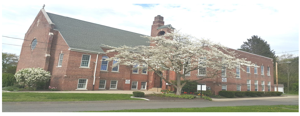
"Faith United Methodist Church's mission is to share God's love and encourage others through worship and service to our community and beyond."